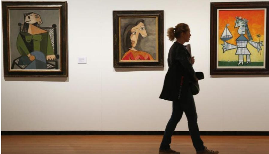
AdSense – Leaderboard 1

The world's largest art auction has been launched online to raise money for those affected by the coronavirus pandemic.